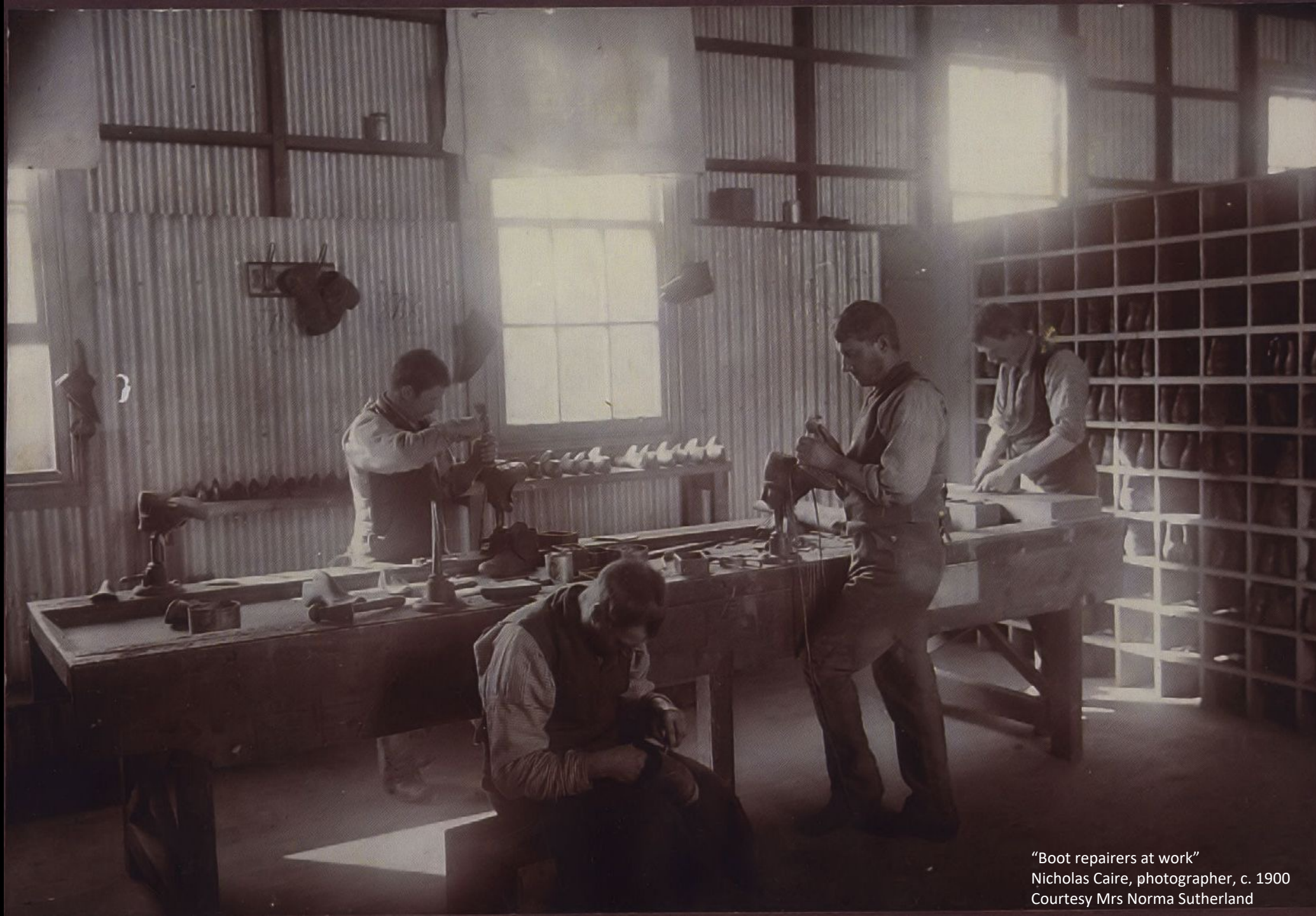
"Boot repairers at work"