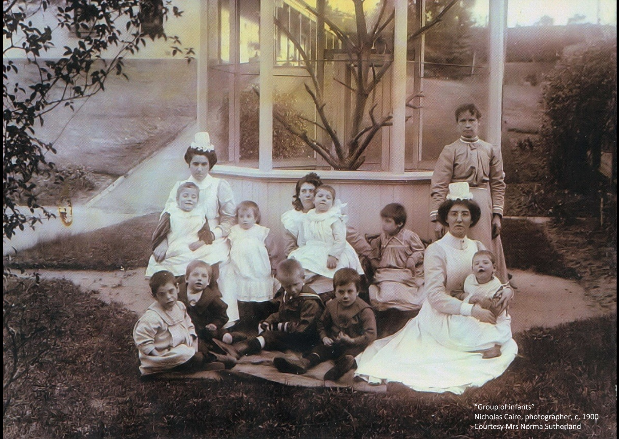
"Group of infants"