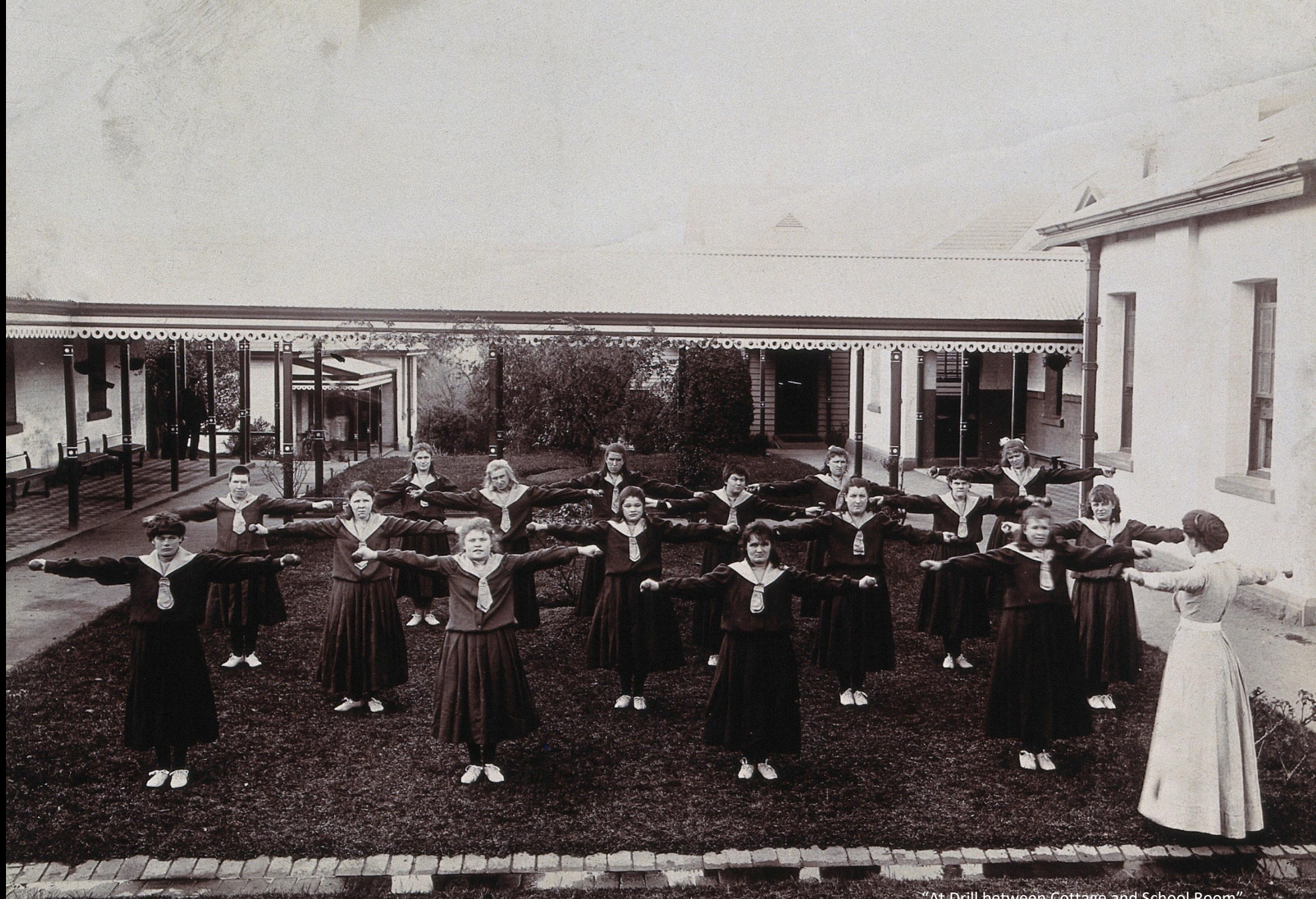
"At Drill between Cottage and School Room" Nicholas Caire, photographer, c. 1900 Courtesy Wellcome Collection; Public Domain Mark