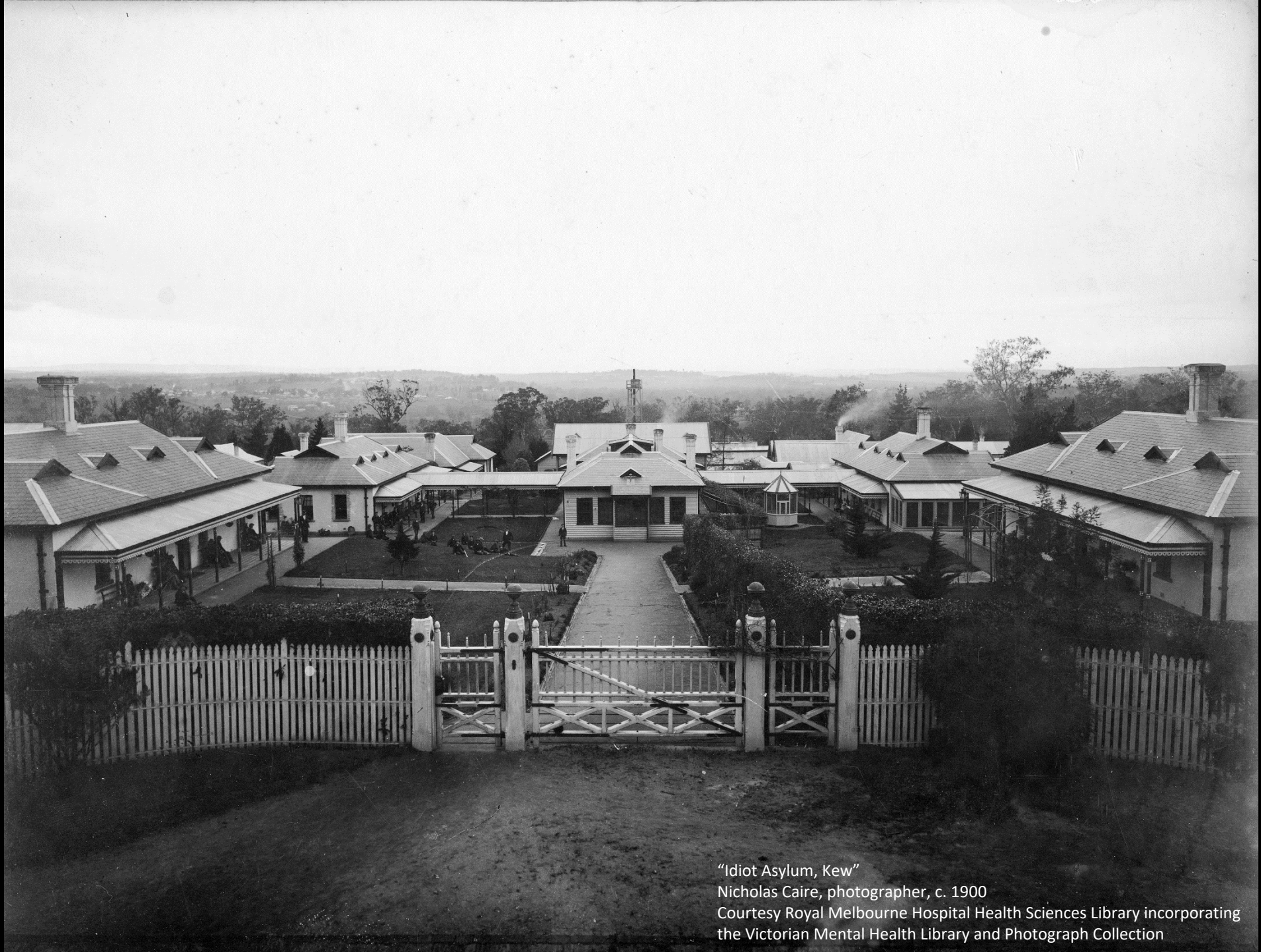
"Idiot Asylum, Kew"