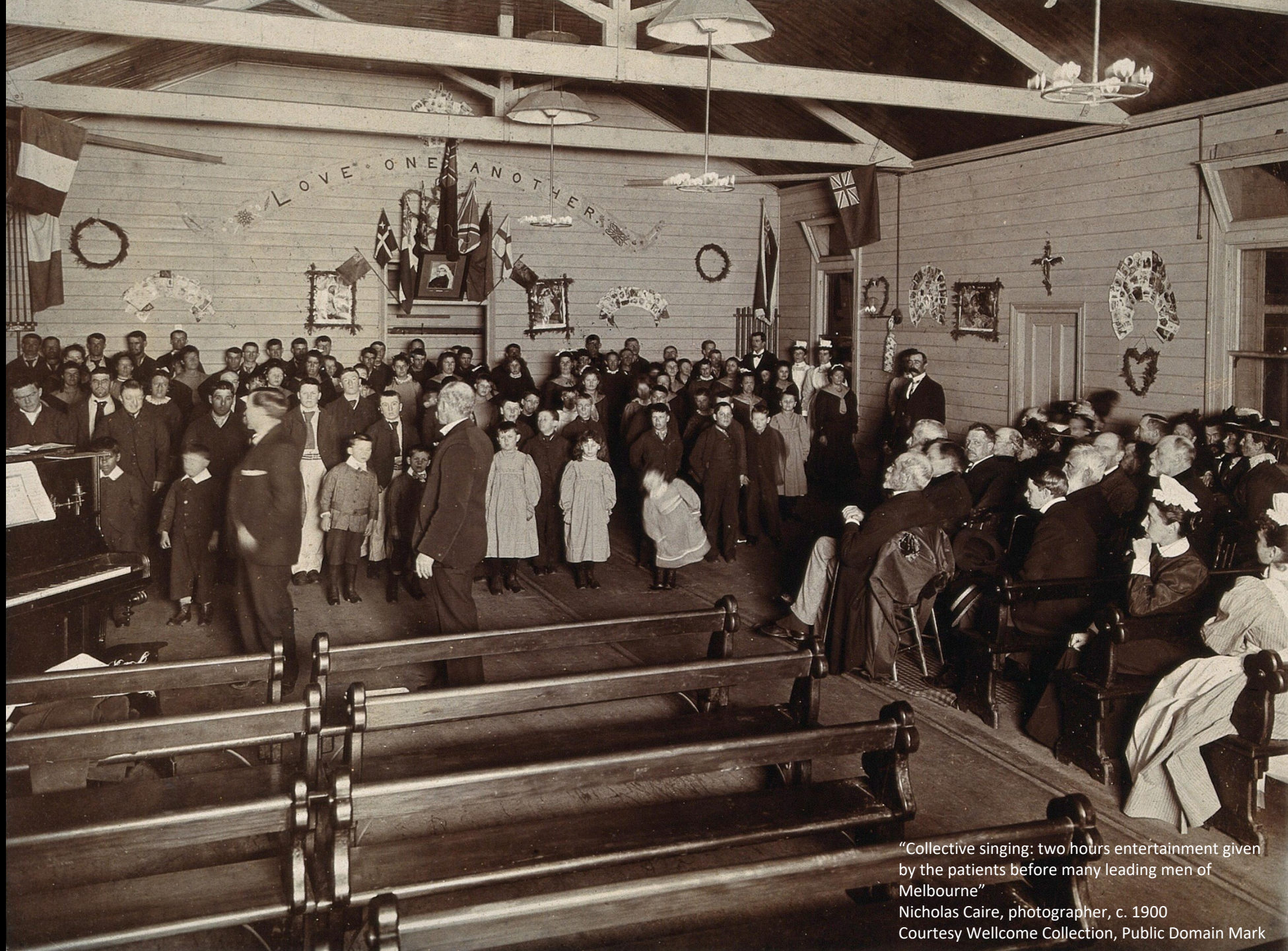
"Collective singing: two hours entertainment given by the patients before many leading men of Melbourne" Nicholas Caire, photographer, c. 1900 Courtesy Wellcome Collection, Public Domain Mark