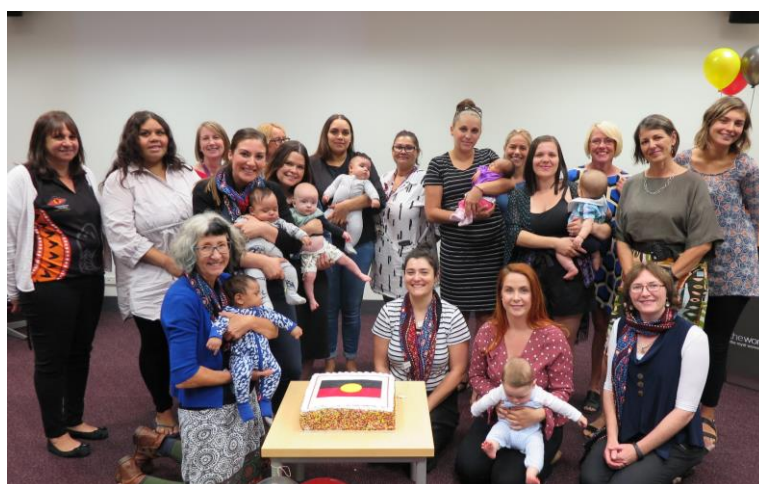
Baggarrook project team with participating mums and babies