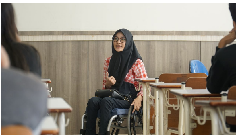
Inclusive Education event – October 2020