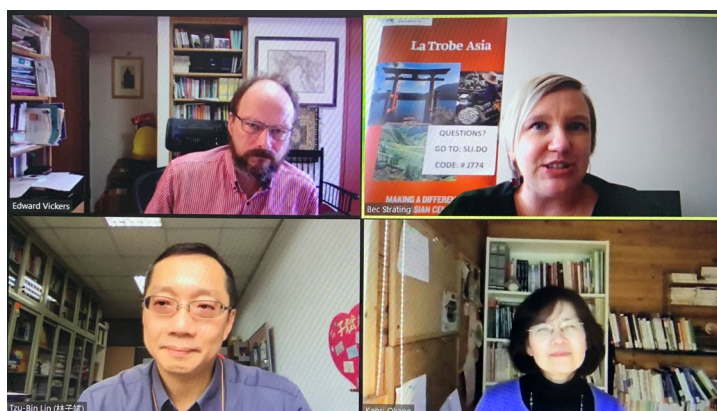
Education and the politics of identity in East Asia today panel, September 2020