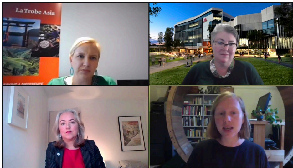
Violating Peace Book Launch – November 2020