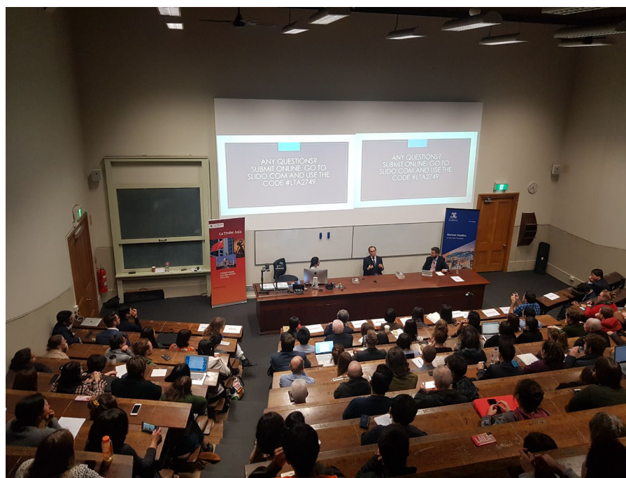
North Korea Defector event – September 2019