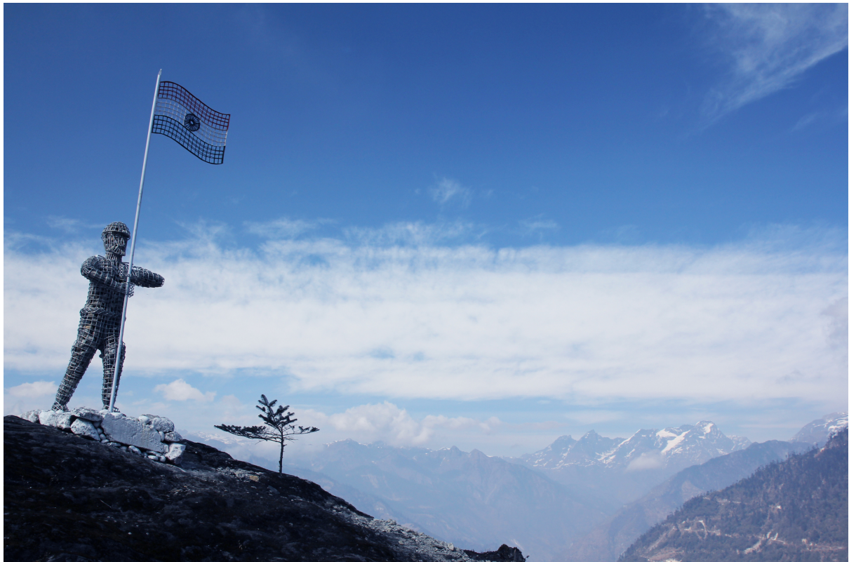
Jaswant Garh War Memorial, Tawang, Arunachal Pradesh, India