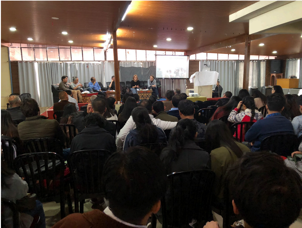
The Sikkim Launch of the third La Trobe Asia Brief , Gangtok.