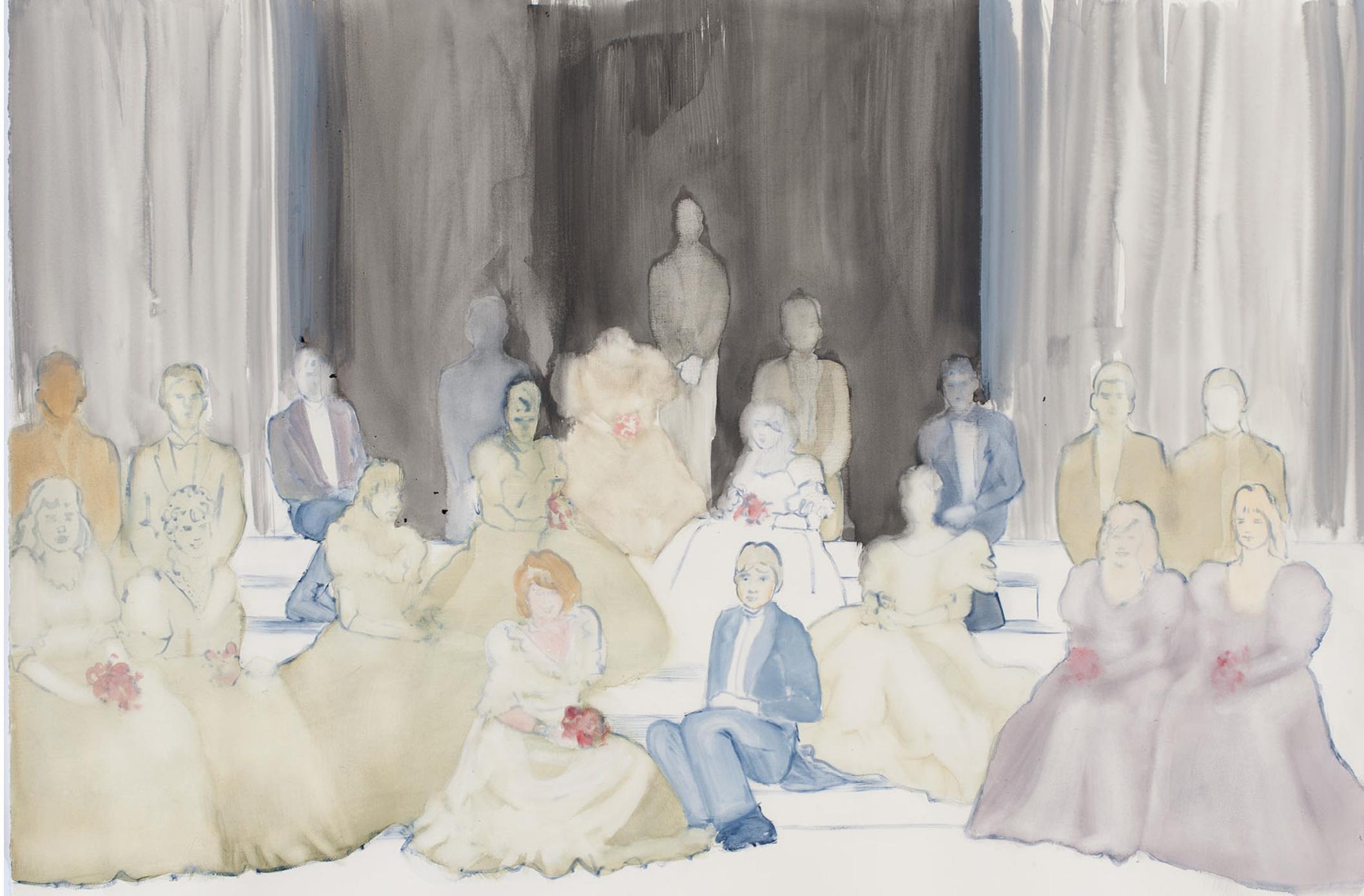
The Group 2010-11