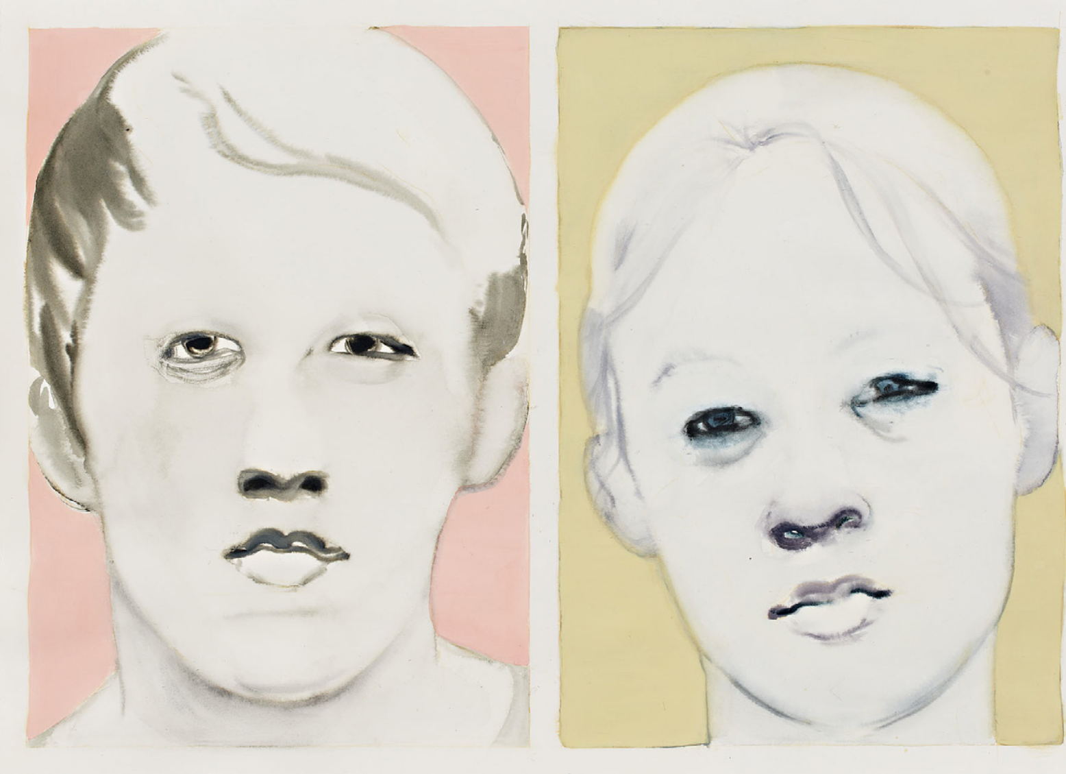
AKA #1 2011