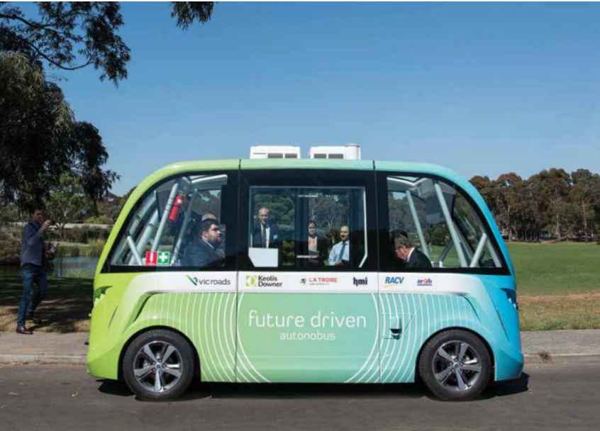
Autonobus Victoria's first autonomous shuttle bus at La Trobe University.

All our projects are in collaboration with industry partners and our teams are predominantly externally funded. In selected cases we even take equity in start-ups. As an R&D Centre we know that the creation of new products is a journey which can take unexpected turns. Our experienced teams can rapidly adapt to changes and challenges in product innovation cycles – always keeping an outcome oriented mindset.