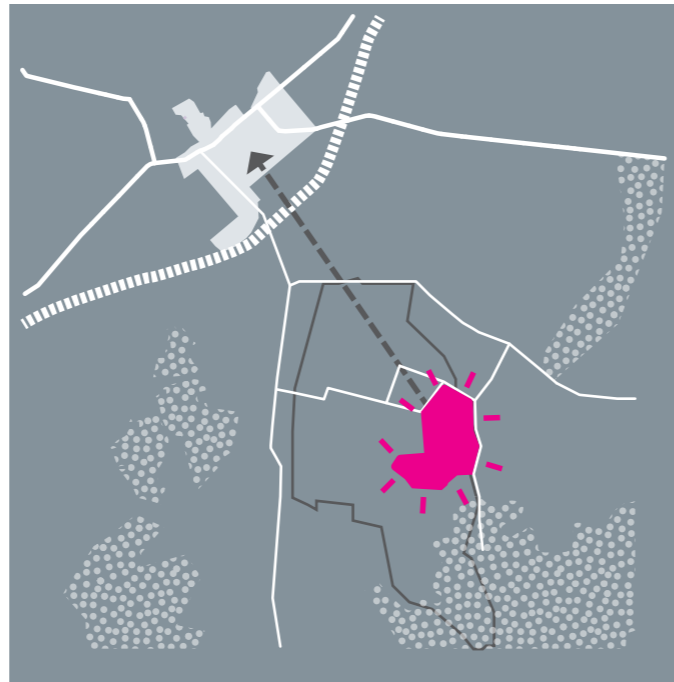
TRANSFORM FLORA HILL