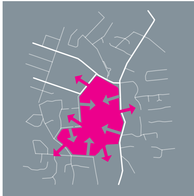
WELCOME THE COMMUNITY IN