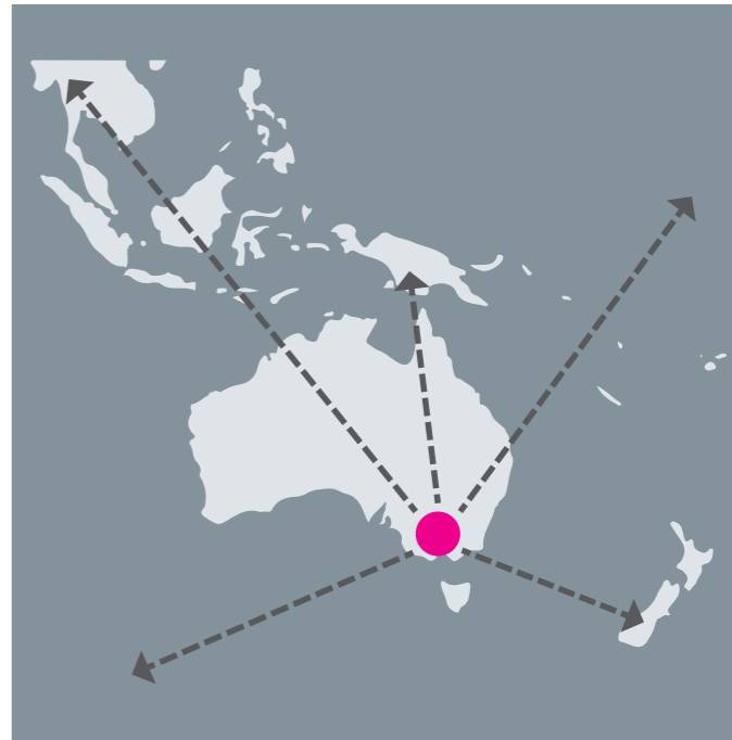
CONNECT TO THE WORLD