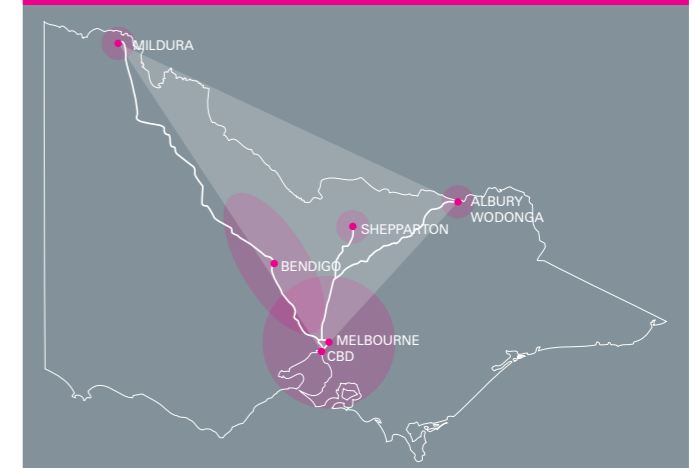
La Trobe University's regional locations.