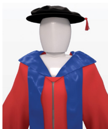
DOCTOR OF PHILOSOPHY