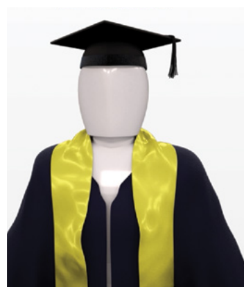
GRADUATE CERTIFICATE AND DIPLOMA