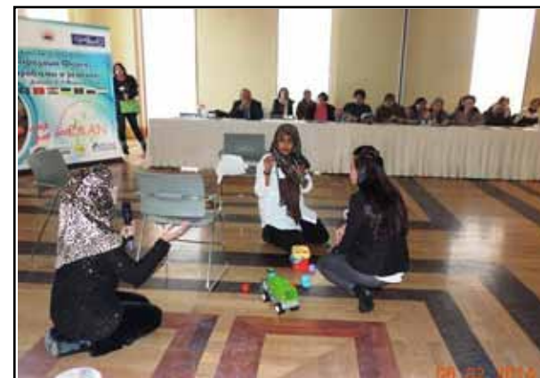
Training at the Central Asian Autism Network.