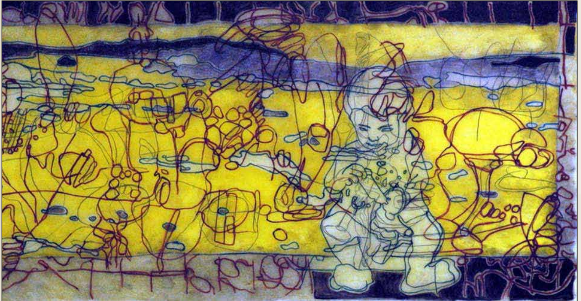
Ray David, Child 2009, oil on polycarbonate, 80 x 185 cm