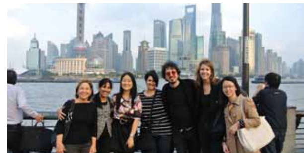
OTARC members and international researchers in Shanghai.