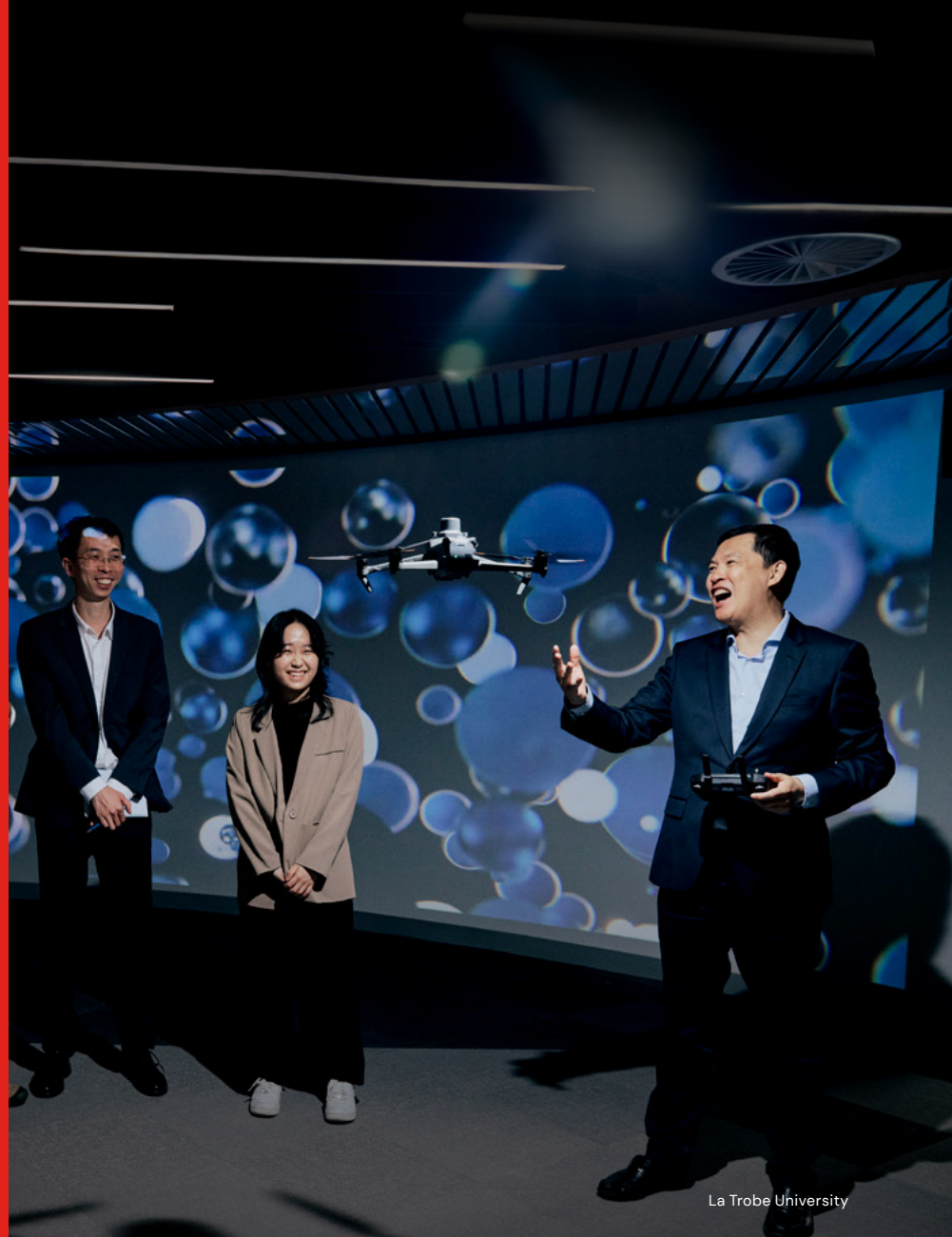
La Trobe University

We look forward to the future with confidence and a strong sense of purpose in our vision where inclusion and innovation produce real-world impact.