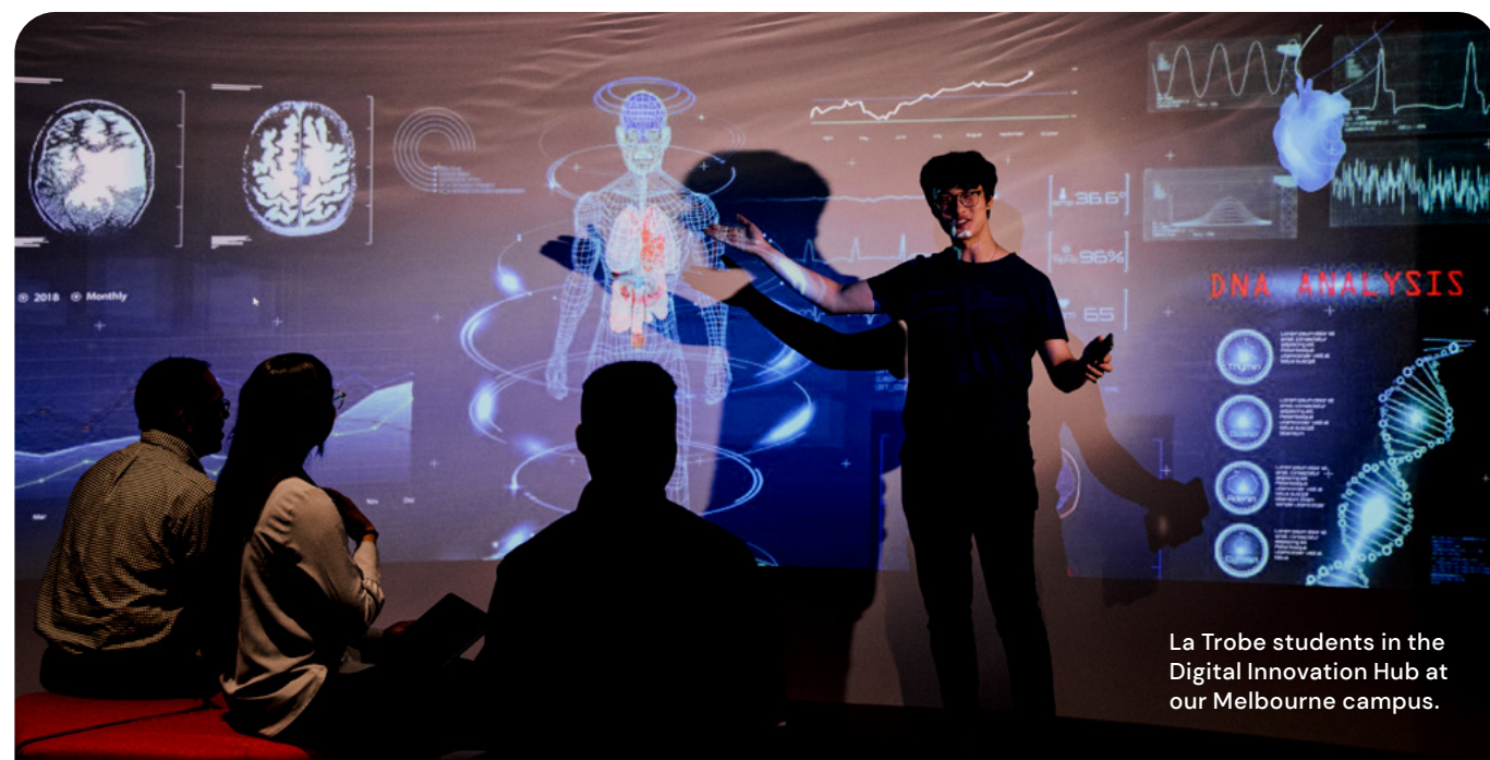
La Trobe students in the Digital Innovation Hub at our Melbourne campus.

By 2030 all staff at La Trobe will be accessing and using AI tools routinely and AI will be integrated in all courses to support student learning