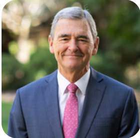
The Hon. John Brumby Chancellor

La Trobe University is proud of our past and the impact we have achieved. We are invested in our staff, our partners, and most of all our students. And we are determined to shape a future that is better for Australia, our region, and the world.