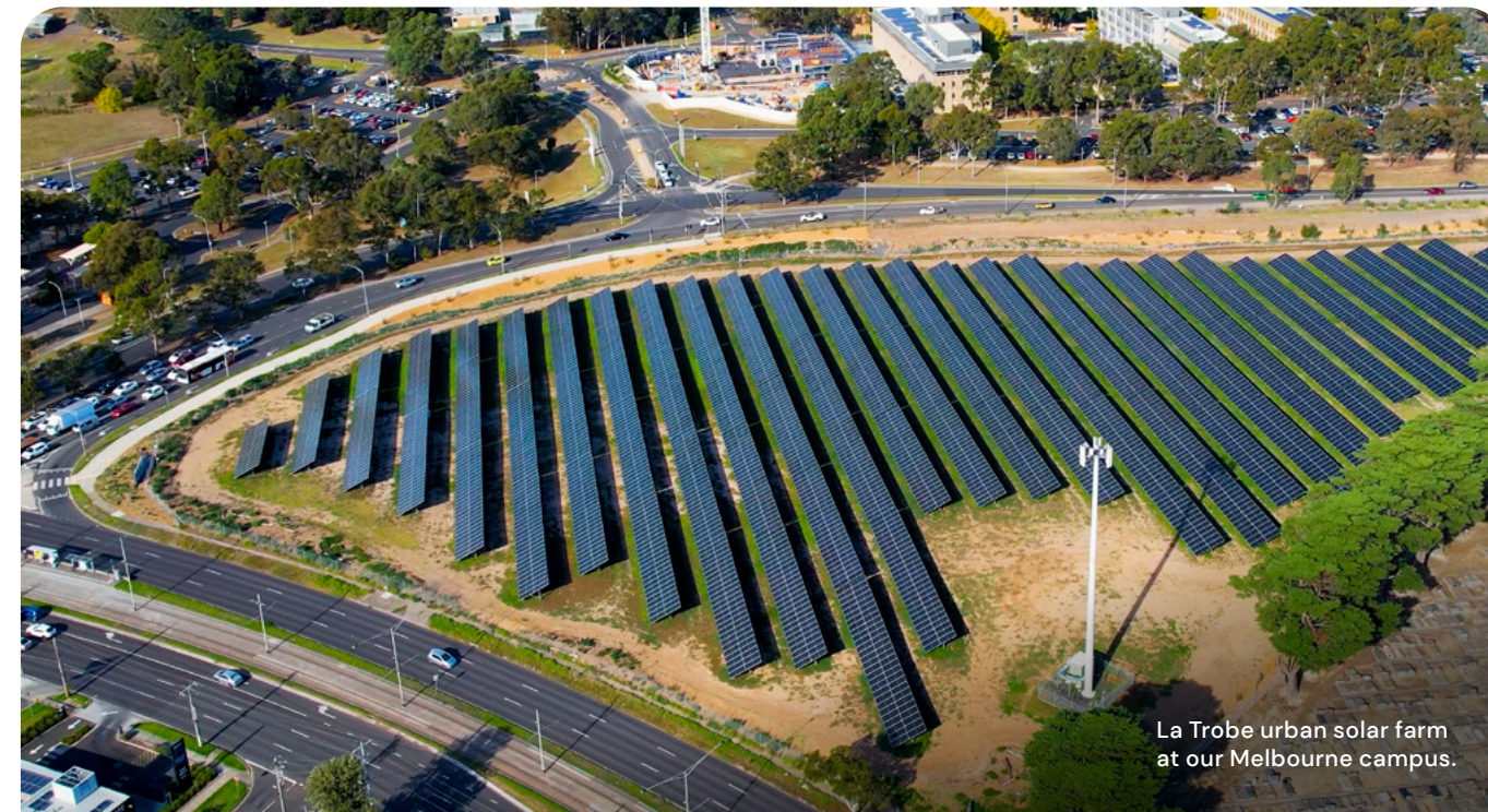
La Trobe urban solar farm at our Melbourne campus.

By 2030 we will pursue a much greater presence and engagement with India