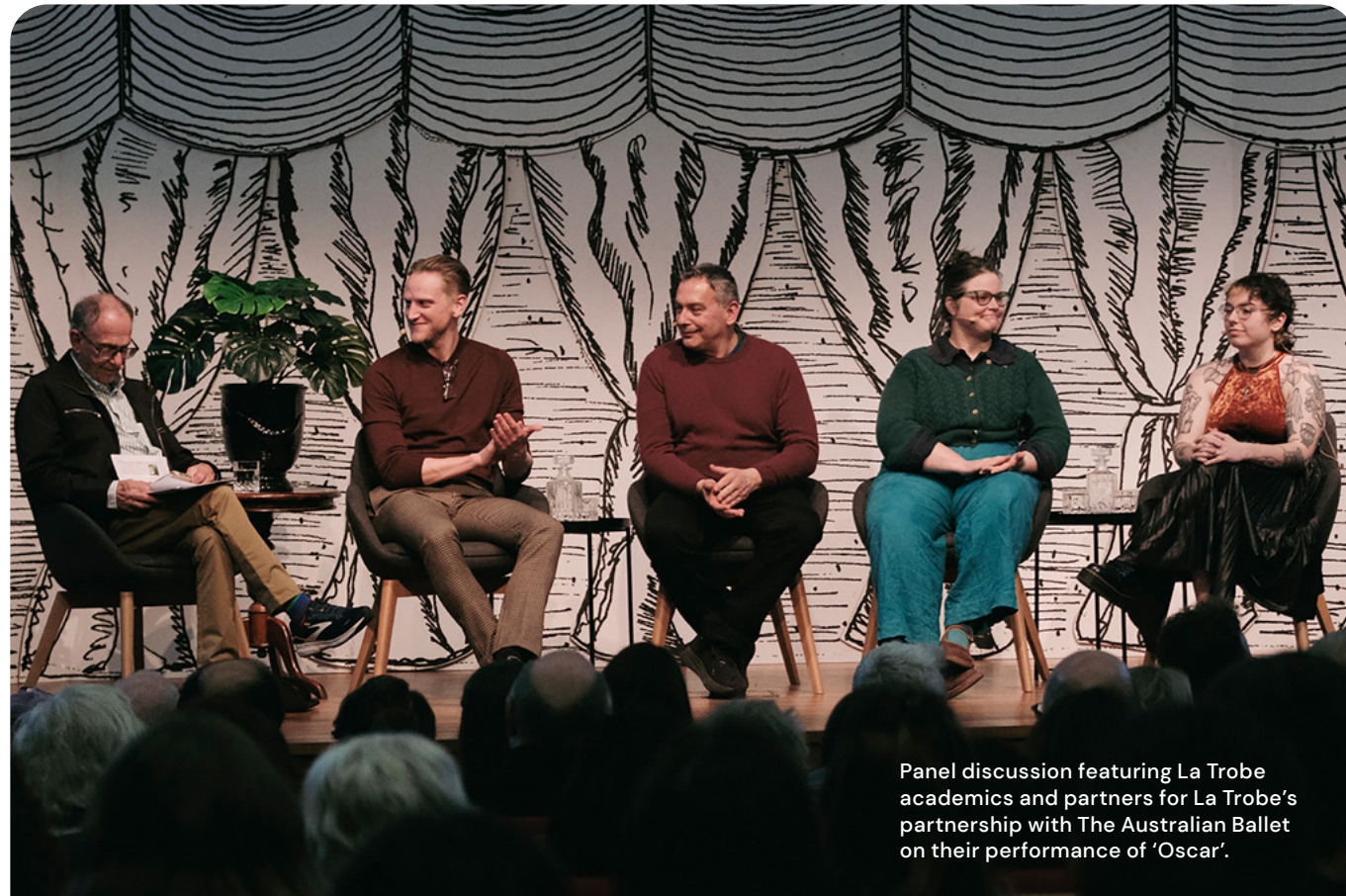
Panel discussion featuring La Trobe academics and partners for La Trobe's partnership with The Australian Ballet on their performance of 'Oscar'.