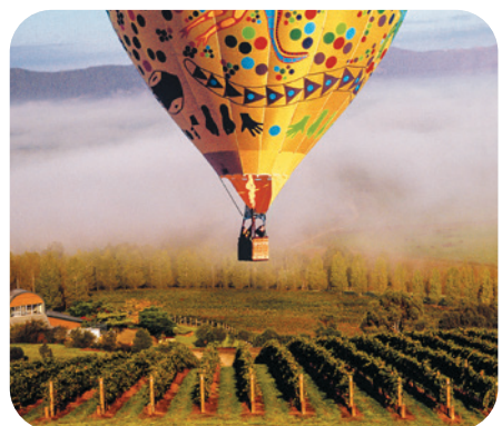
An early morning balloon ride