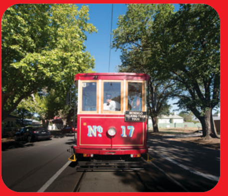
Ride aboard Bendigo's vintage tram

Bendigo is a vibrant hub in regional Victoria. Originally the epicentre of the 1850s goldrush, it is rich in Australian history and features grand, Victorian-era architecture. Bendigo also has a strong multicultural history, with one in five members of its early population emigrating from China. Now a large and modern city, it remains surrounded by native bushland. This gives it a bright yet relaxed energy and ensures a rich and focused learning experience.