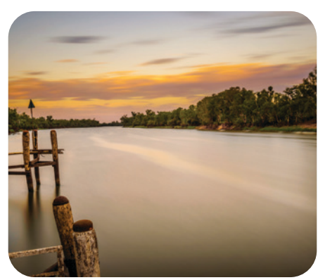
The Murray River near Mildura