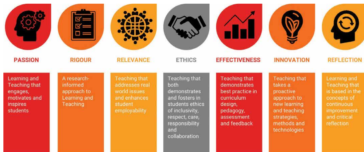
The Teaching Excellence Principles