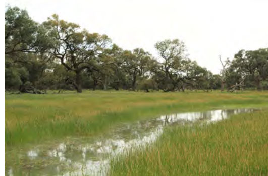
Murrumbidgee river floodplain