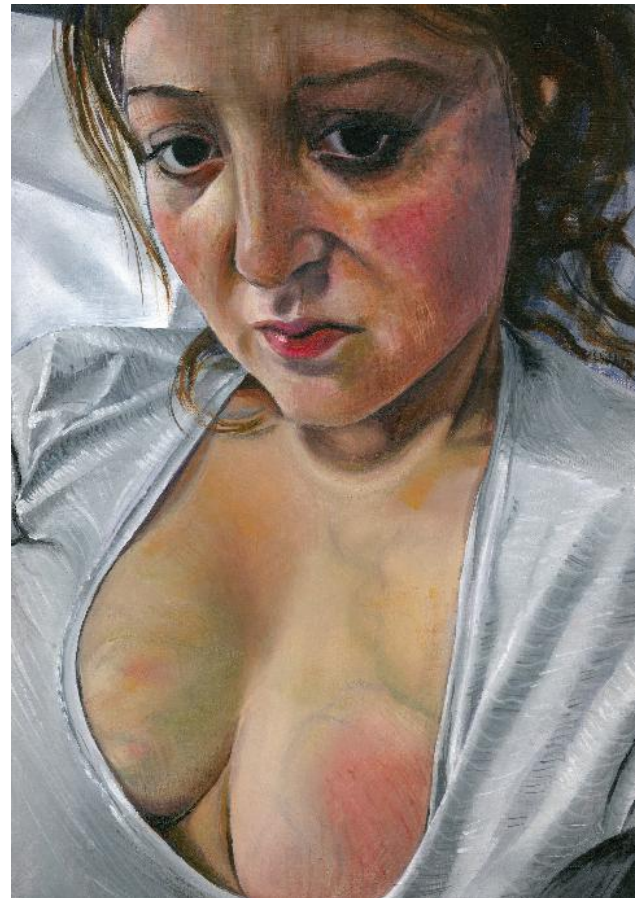
This is mastitis – Painting by Leanne Pearce

Funding: NHMRC Ideas Grant 2022-26 Status: data collection complete; samples sent to Adelaide; analysis ongoing