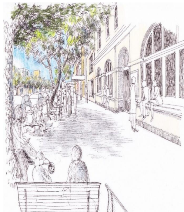
Illustration from Jenny Donovan's report "Designing shared and public spaces to be breastfeeding friendly" (2019)

Status: presented at local and international conferences; papers in preparation