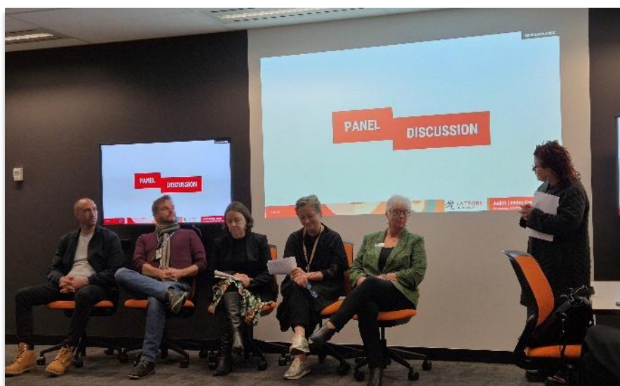
Work-Family Research, Practice and Policy forum, May 2025