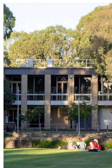
La Trobe University Bundoora Campus

Sex education as women's work? Supporting parents and carers to speak with children about sex and relationships