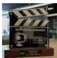
The Library – winner of a national award from the Australian Video Producers Association for best Induction Video.