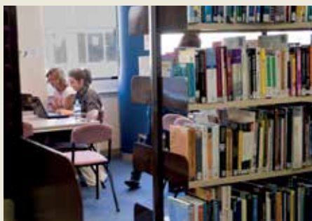
Campus Library Shepparton T +61 3 5820 8693