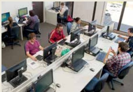
Heyward Library Bendigo T +61 3 5444 7451