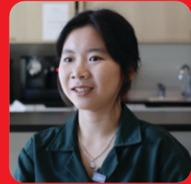
KC Bachelor of Commerce

La Trobe's Finance Trading Room simulates a live trading environment, where students learn to use the Refinitiv platform with access to real-time market data, company and security information, and investment analytics.