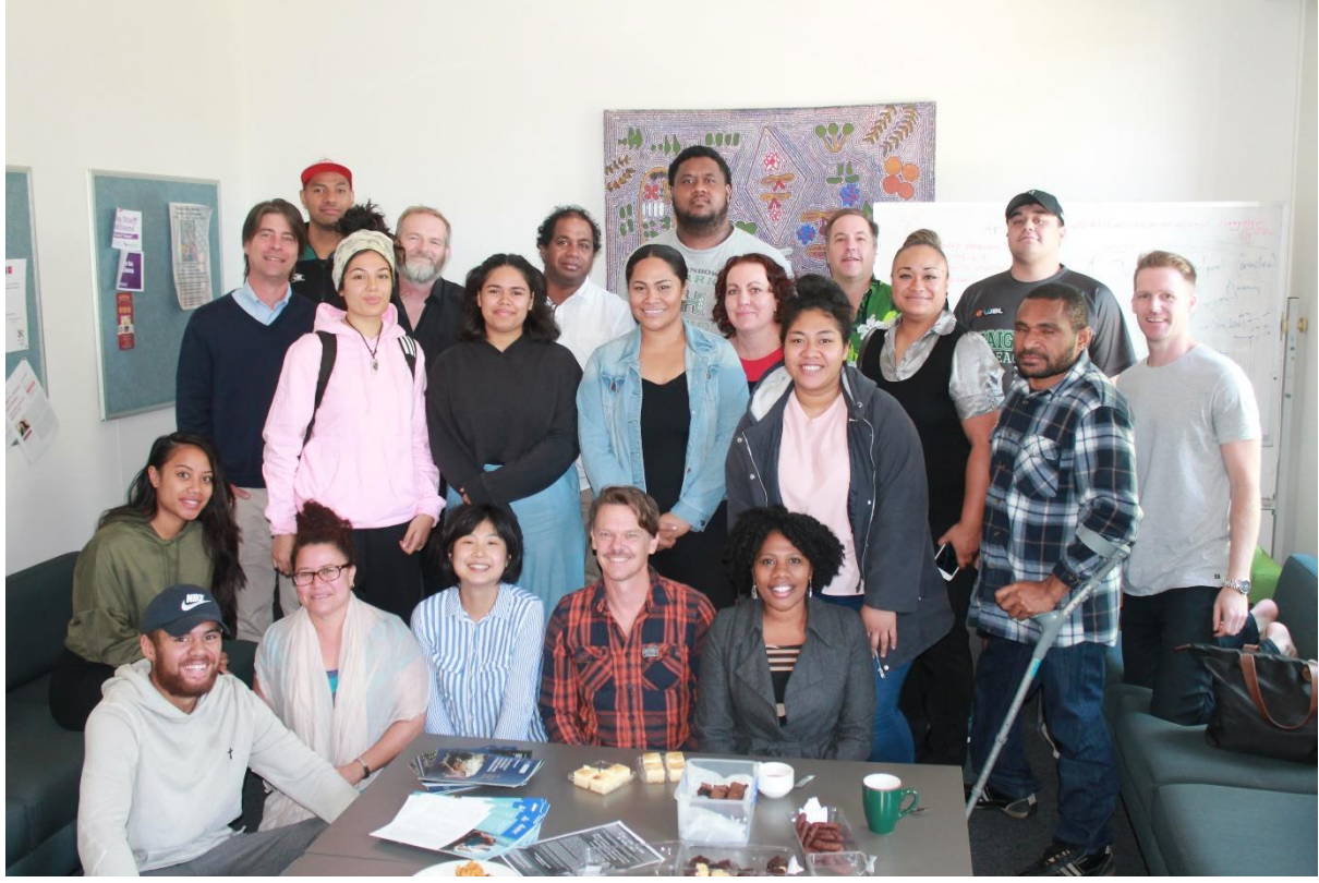
Institute researchers and staff with Pacific Research Community colleagues and Pasifika students, March 2018