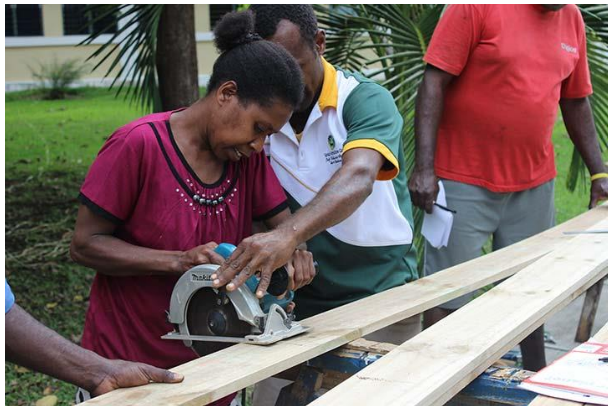
Workshop participants at Agriculture College building food solar drier for food preservation – Vanuatu Skills Program.

The <u>Australian Research Council</u> (ARC) defines impact as, "the contribution that research makes to the economy, society, environment or culture, beyond the contribution to academic research." The ARC defines engagement as, "the interaction between researchers and research end-users outside of academia, for the mutually beneficial transfer of knowledge, technologies, methods or resources." The Institute focuses intensively on applied research, developed with industry partners, which influences changes in policy and practice.