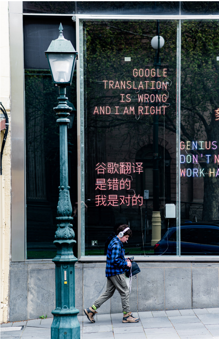
Chunxiao Qu born Qingdao, China, 1993; arrived Australia 2014 An artist doesn’t need a label , 2022 La Trobe Art Institute Biannual Façade Commission, 2022 © Chunxiao Qu.