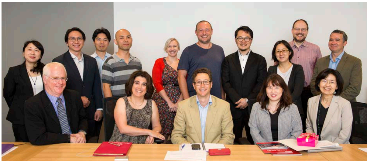
Delegation from Kyushu University and La Trobe University Social Sciences Academics – March 2016