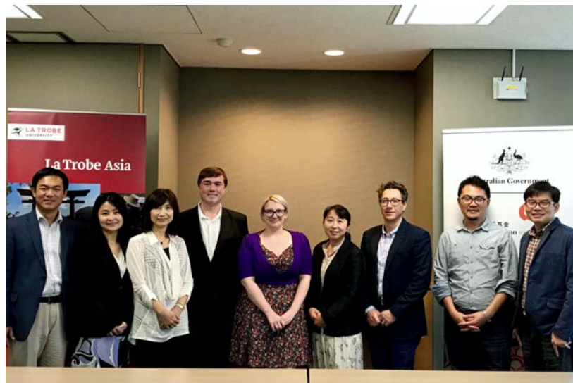
Experts Workshop participants – September 2017