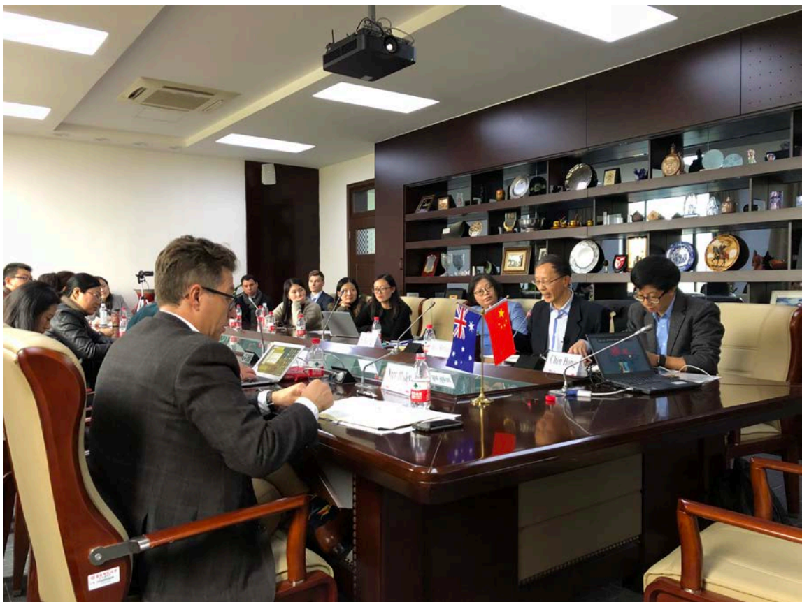
Second Australia-China Forum, Shanghai – November 2017