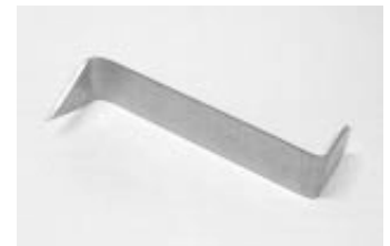
Figure 3. The completed device.

After filing a bevel on the outside surfaces of the pointed and rounded ends, the tool is ready for use. Figure 3 shows a completed grooving tool.