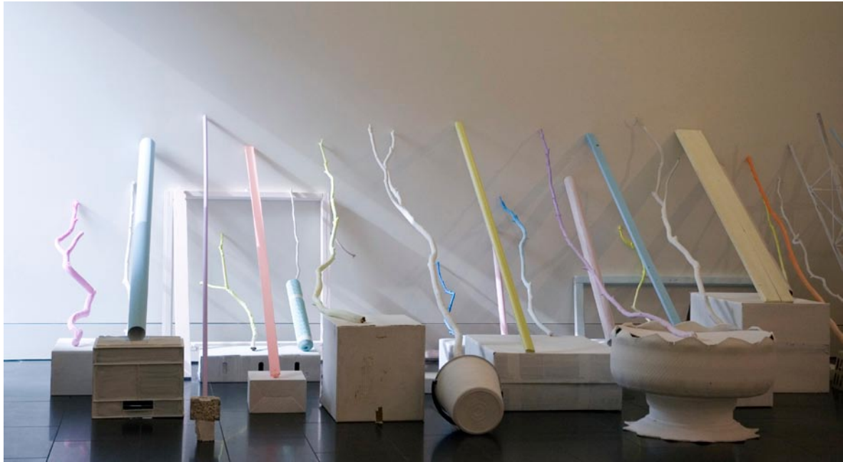
Mary Louise Edwards, 2007, Detail of installation, 10 degrees, 5pm : watercolour painting with gum tree, dam and dwelling found objects, scenic paint dimensions variable