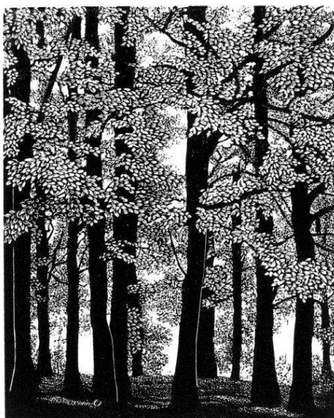
Elms – Porepunkah 2005 wood engraving 12.6 x 10 cm