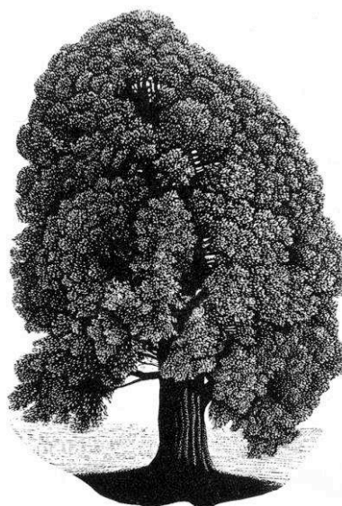
Tree – Bogong 2005 wood engraving 12.5 x 8.5 cm