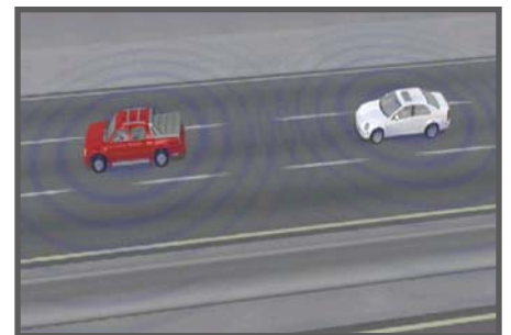
COOPERATIVE COLLISION WARNING

This opens a new direction towards low-cost active safety by employing cooperative collision warning systems for crash avoidance and collision mitigation, resulting in “360 Degrees Driver Situation”.