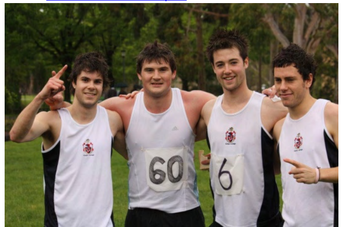
Glenn college Men's Team – Fastest Male Team

This year was the first year we saw "Walk on Your Lunch Break". This event began at 12.00pm, prior to the run. Over 30 walkers participated in the walk which used the Ring Road Relay course and raised money and awareness for Oxfam Australia. For more information, results and photos visit our web site www.latrobe.edu.au/sport