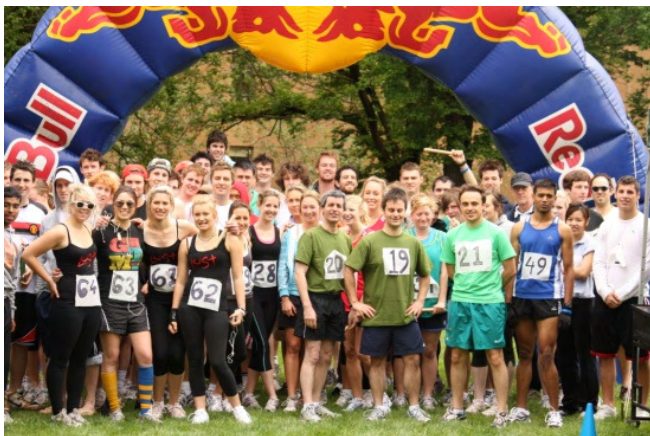
Before the start of the Ring Road Relay

The 2009 annual Ring Road Relay saw 18 teams brave the cold rainy weather on Thursday the 15 th October, to complete the 2.7km track around the La Trobe University Bundoora Campus. With the rain holding off for the start of the race, it didn't take long until all spectators were running for cover and cheering on the runners from the shelters. Runners included staff, students and college residents of La Trobe University.