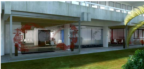
External View of weather shield screens to Hub, view online: http://www.latrobe.edu.au/staff/assets/images/Hub-External-View-Screens.jpg