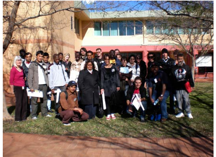
Bridging Program Students

and Diversity Centre has provided funds for additional classes in English as a second language, and in basic computer skills for this group of students.