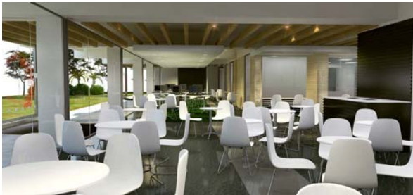
Internal View of Computer Area of Hub, view online: http://www.latrobe.edu.au/staff/assets/images/Hub-Internal-View-Computer-Area.jpg