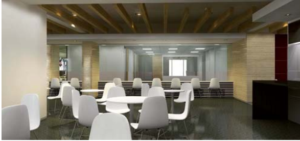
Internal View of Service Counter of Hub, view online: http://www.latrobe.edu.au/staff/assets/images/Hub-Internal-View-of-Service-Counter.jpg