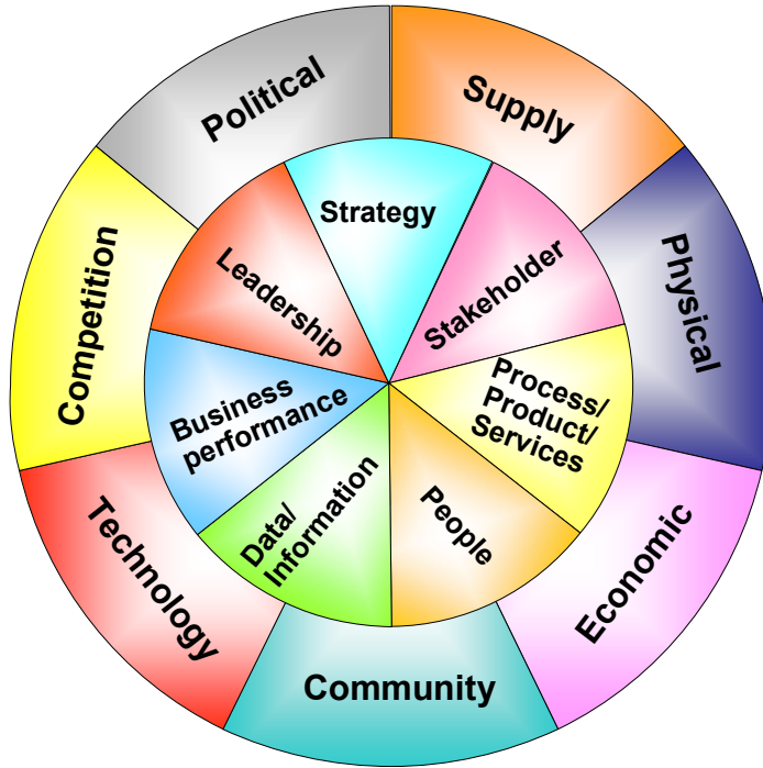
Figure Sources of Risk