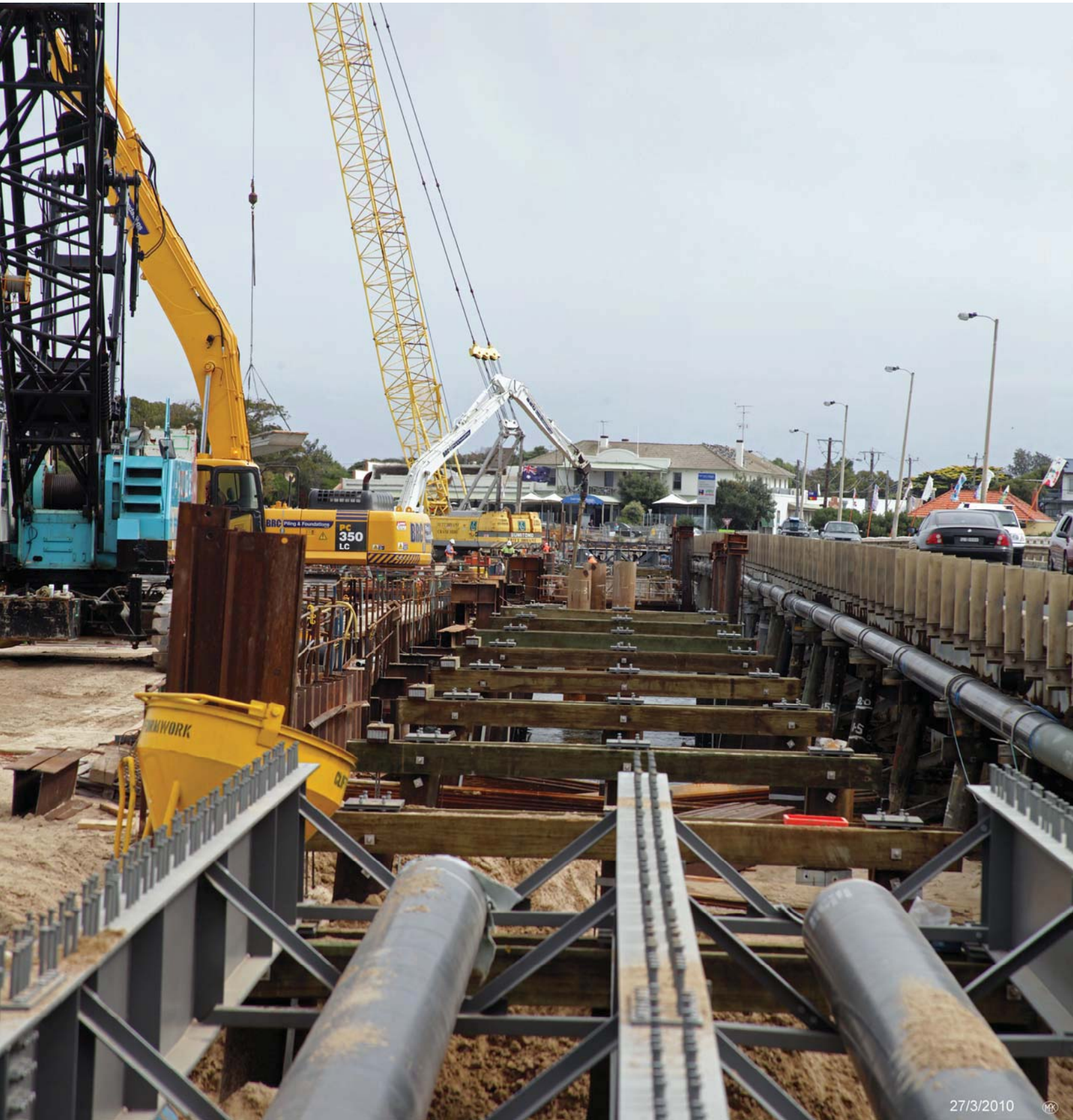
Stage 1 of bridge construction - Road Bridge Piling, Timber and Steel building towards the centre of the bridge