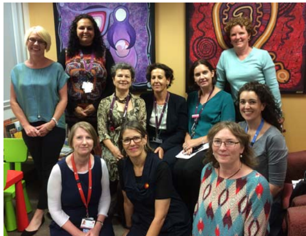
Improving The Health Of Aboriginal Mothers And Babies research team